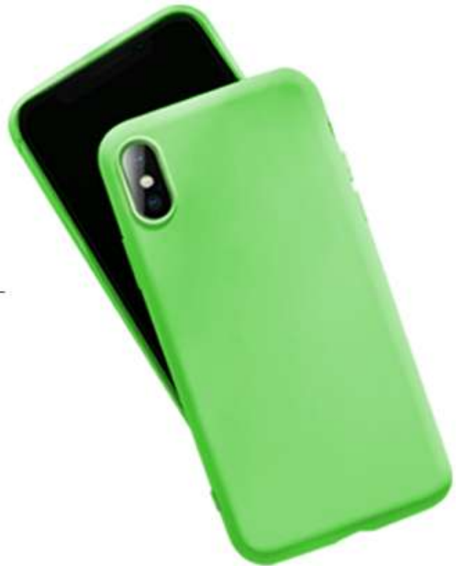
Mobile phone shell